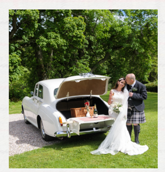
'Thank you so much for providing the most perfect location for our wedding. Aswanley is an absolute hidden gem - a blank canvas that can be turned into anything you want it to be'