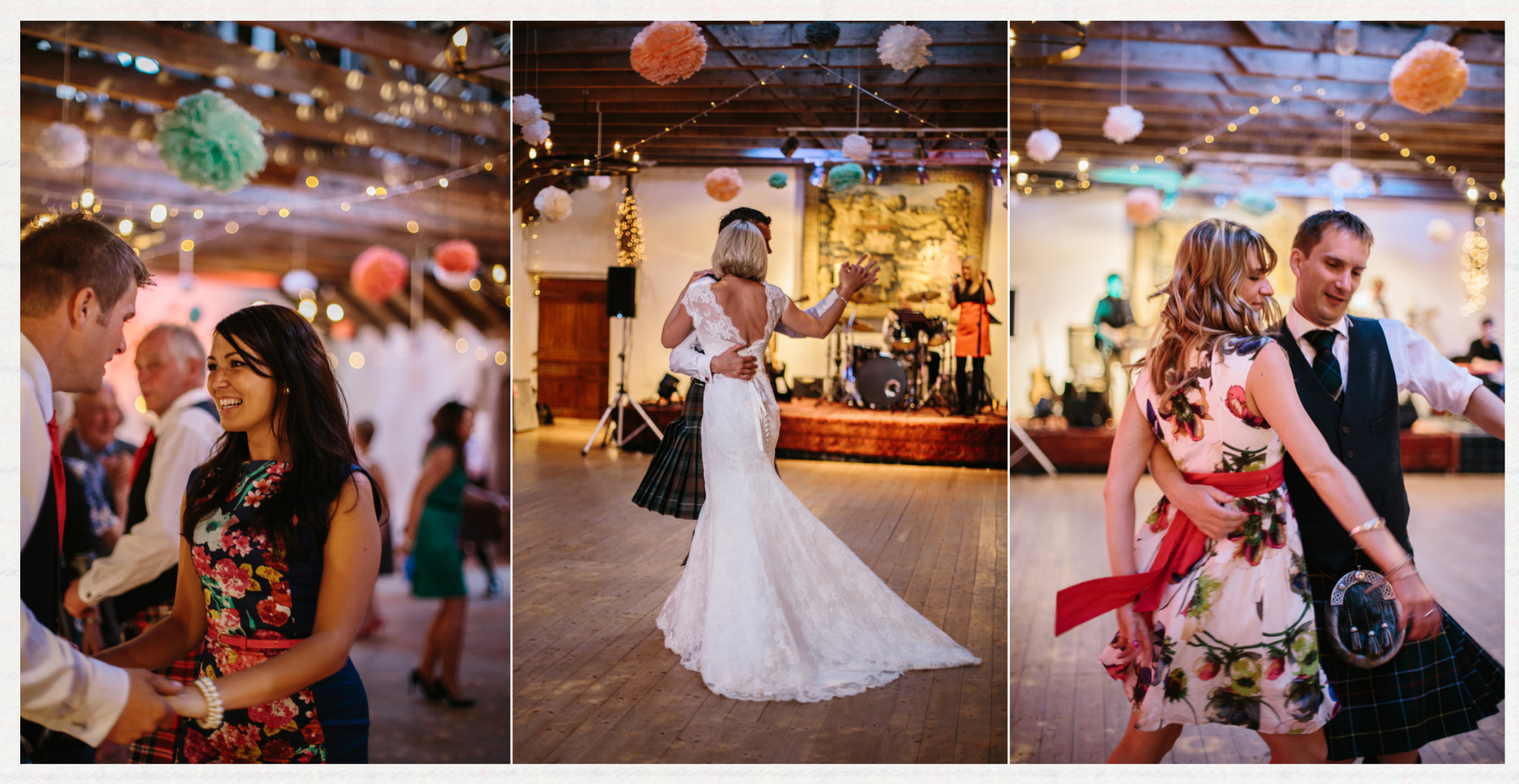
... once the formalities are over, the barn is the ultimate place to celebrate.